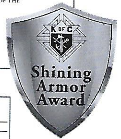
Lapel Pin (#1700)